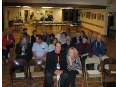
The audience waiting for the Student Speakers contest to begin