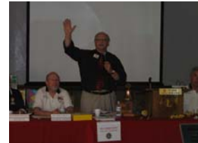
PID Bill and VDG Bill at the cabinet meeting