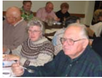
Lion Les & Locksey