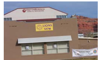
St. George, Utah Lions & VFW Building