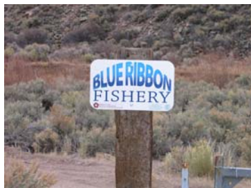
I would rather be fishing!