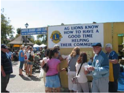
Harvest Festival 2007