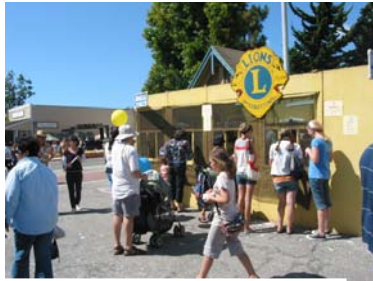
Our booth at Harvest Festival 2007