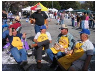
This picture from 2006 looks just like one from 2007—are the boys still sitting there?