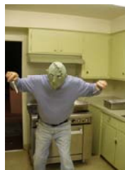
Lion Tom—you want your meat how?