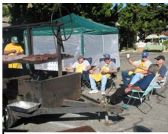
The "crew" working hard