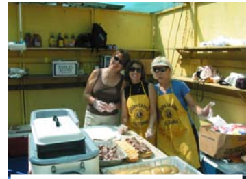
Our ladies helping us at Harvest Festival 2007