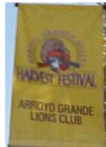
Our Harvest Festival Banner