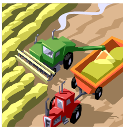
Harvesting the crops