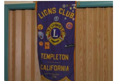
We stole their banner (digitally)