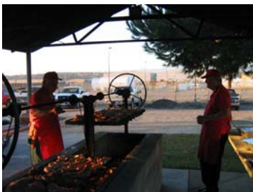
Pleasant Valley Lions barbecue too