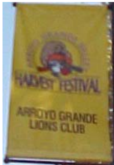
Harvest festival banner