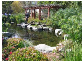
Japanese gardens at City of Hope